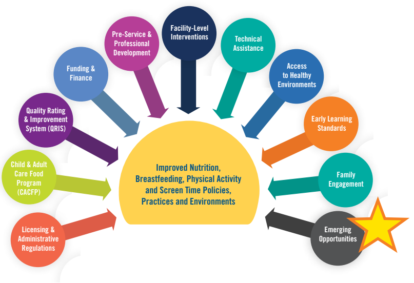
Figure 2: Areas of Focus within the CDC Spectrum of Opportunities

The emerging opportunities implemented in Arizona, North/Central Florida and South Florida varied. Strategies ranged from expanding training through modified ECELC models (e.g., North/Central Florida's adaptations to support Head Start grantees)