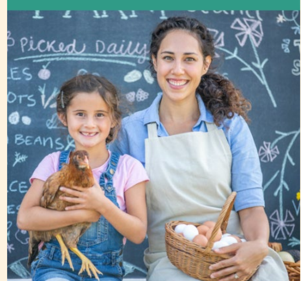
Farm to Early Care and Education Learning Collaboratives Local Foods, Healthy Kids Resource Guide June 2024