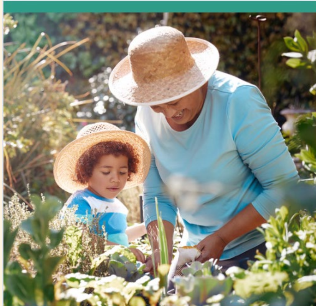
Farm to Early Care and Education Learning Collaboratives Gardening Resource Guide May 2024