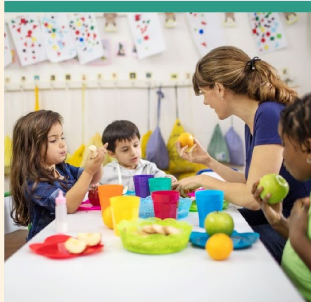
Farm to Early Care and Education Learning Collaboratives Food and Farming Education Resource Guide June 2024